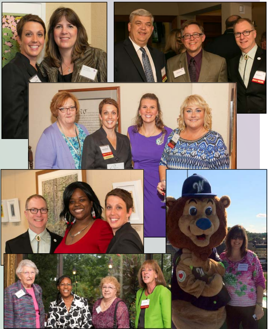
Below: Board Members past and present and volunteers participate in 2014 fundraising activities including the Gone to the Birds Gala & Auction and RCAP Solutions Night at the Worcester Bravehearts.