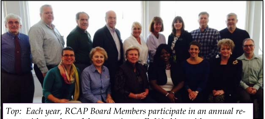
Top: Each year, RCAP Board Members participate in an annual retreat with members of the executive staff. Working with expert consultants, the retreat challenges our volunteers to think in new directions and prepares the organization for excellence.