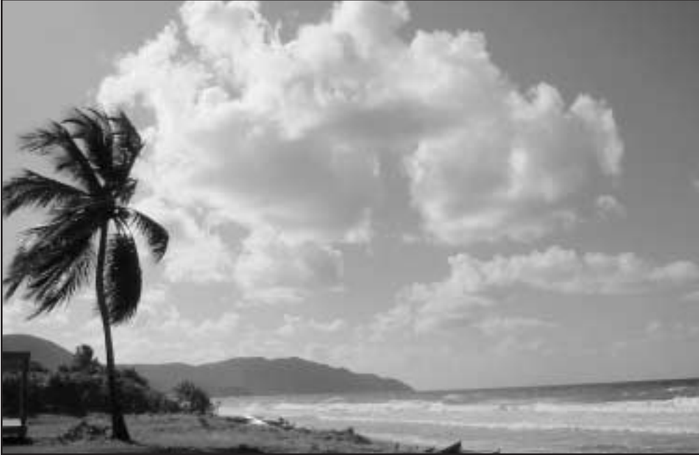
Thunderheads tantalize St. Croix's hunger for fresh drinking water