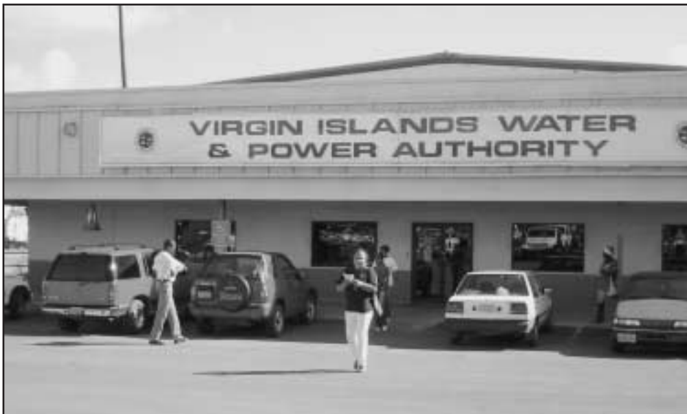
WAPA business office, Christiansted, St. Croix.

RCAP Solutions, Inc. has been providing technical assistance to the Virgin Islands in cooperation with the Department of Planning and Natural Resource, St. Croix, USVI. Our work there has focused on assisting WAPA with water quality problems, as well as addressing the technical, managerial and financial capacity of community water systems that are served by WAPA. This article reviews the efforts of WAPA, assisted by RCAP Solutions and the USVI Division of Environmental Protection, to address problematic levels of Disinfection By-Products.